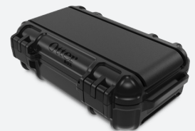
Black 77-54438 UPC: 660543408239