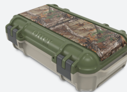
Trail Side 77-54439 UPC: 660543408246