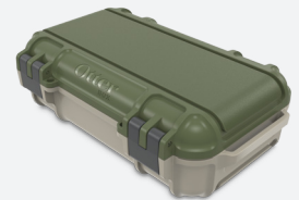
Ridgeline 77-54437 UPC: 660543408222